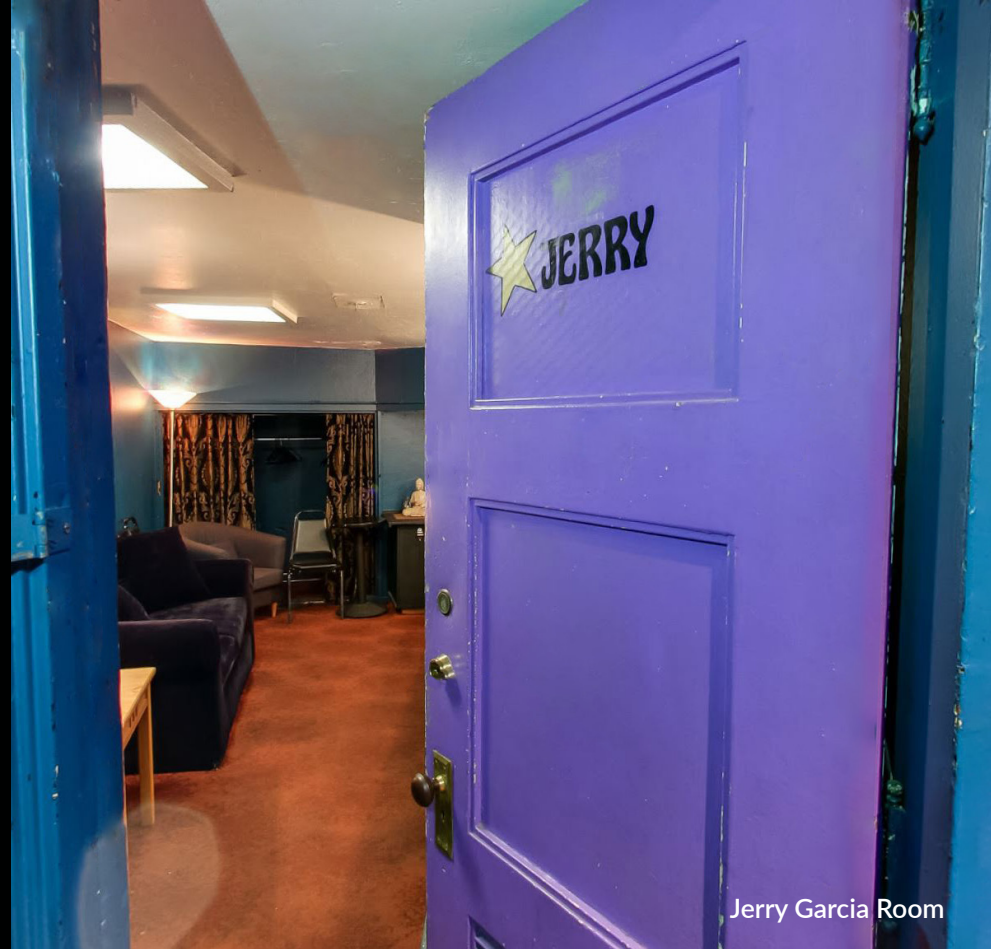
Jerry Garcia Room

Autograph Room - one of the Warfield's hidden gems. The walls have been collecting signatures from almost every performer who has graced The Warfield stage.