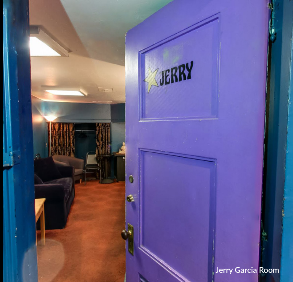
Jerry Garcia Room

Autograph Room - one of the Warfield's hidden gems. The walls have been collecting signatures from almost every performer who has graced The Warfield stage.